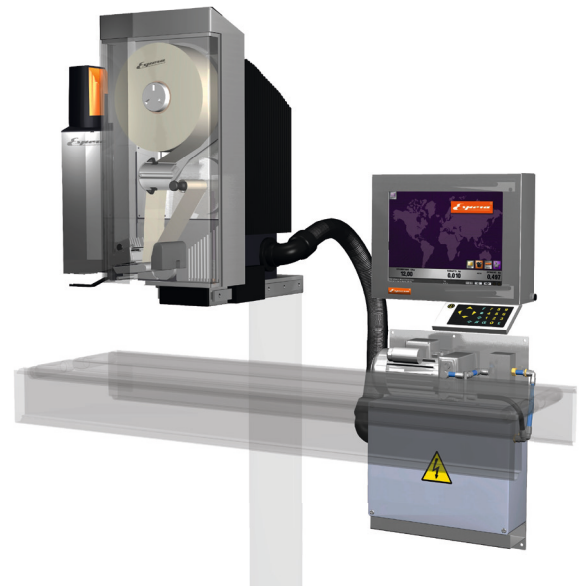
ES 9100 Labeller for integration into existing transport system