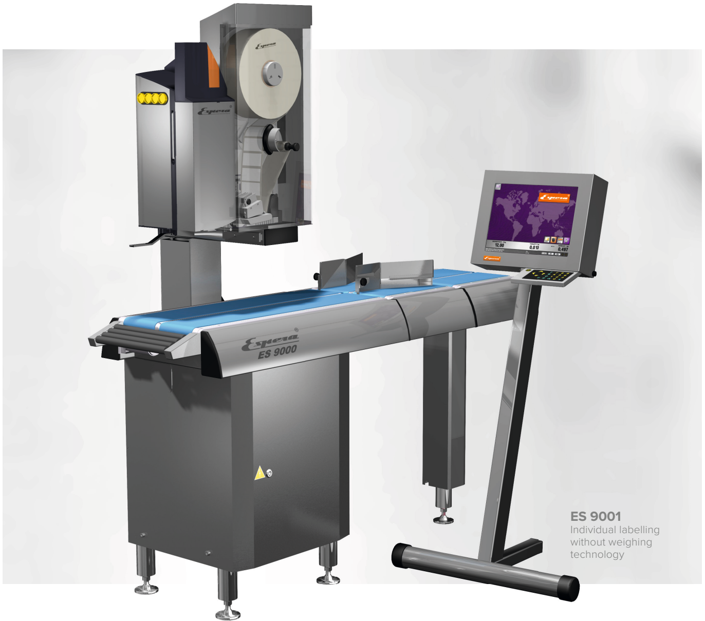
ES 9001 Individual labelling without weighing technology